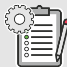
CUSTOM QUIZ BUILDER